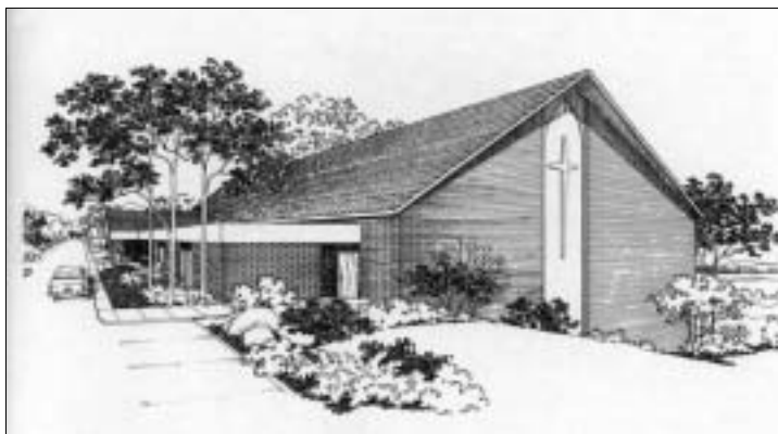
Rivercrest Community Church

Board meetings are held at Hanna Deines's home, located at 2008 NE 156th Court, Portland, Oregon. Phone: 503.252.6036.